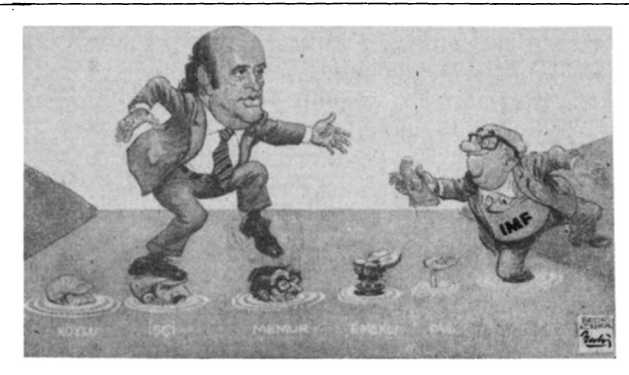
Demirel stepping on peasant, worker, bureaucrat, retiree and widow to reach IMF Funds. Credit: Bedri Koraman, Milliyet, January 31, 1980.

The military coup restored some measure of banking confidence, signified by announcements of new loans: $95 million from five US banks on October 5, and $87 million from the World Bank on November 21. For all of 1980, commercial banks will provide an estimated $588 million in short-term trade credits. But the private banks are reluctant to make any more substantial long